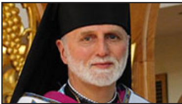
Archbishop Borys Gudziak Archeprarchy of Philadelphia, PA Ukrainian Greek Catholic Church President, Ukrainian Catholic University, L'viv

While nations go to war, Christian churches can stand together to witness and work for peace. Cardinal Walter Kasper has called ecumenical dialogue a peace movement because it witnesses to and works for the reconciliation of all people made possible in Jesus Christ. At this event, participants will hear from three leading figures of churches involved with the citizens, refugees and the grieving in Ukraine: