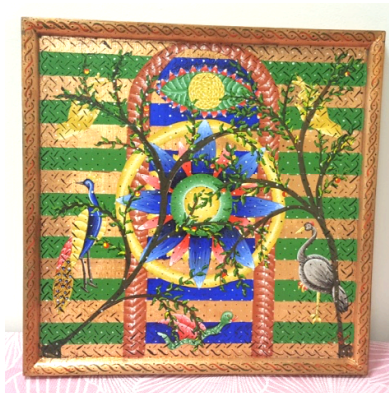
Sokolove Painting – "Finding Direction" Hand-painted, wooden frame.