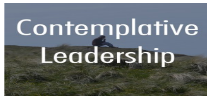
Contemplative Leadership Seminar—Online, Shalem Institute