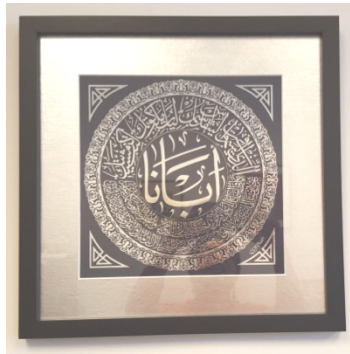
Framed "Our Father," Lord's Prayer in Arabic

Wonderful black and silver metallic textured artwork from Middle East with contemporary black block-style frame.